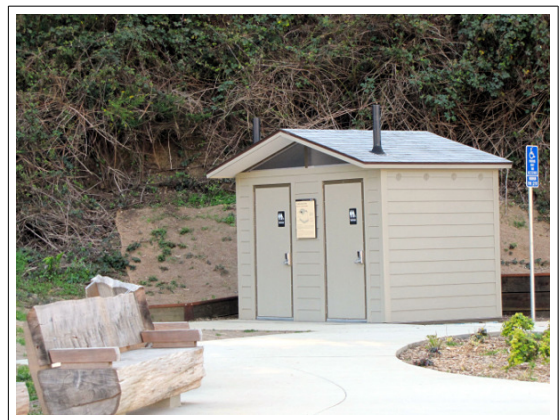
The M54 Double Trailhead unit

“Public feedback has been very positive. We have very limited public facilities in the Presidio, so park users are very excited to have this amenity in the Presidio. Programmatically, it’s great to be able to share our generation’s layer of water