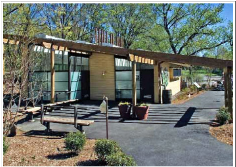
The Bronx Zoo Eco-Restroom

Further details may be found on the Clivus Multrum website, at http://www.clivusmultrum.com/green-building-bronx.php . Of special note is an article that appeared in Recreation Management Magazine in 2007. Just click on the “Facility Profile” link at the bottom of the page reached by the above link.